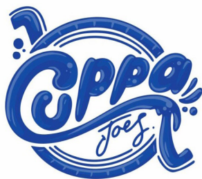
5. Cuppa Joes Coffee Shop