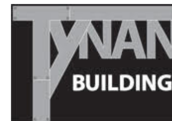
12. Tynan Building