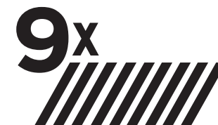
14. Nine Ways Sideways Designs