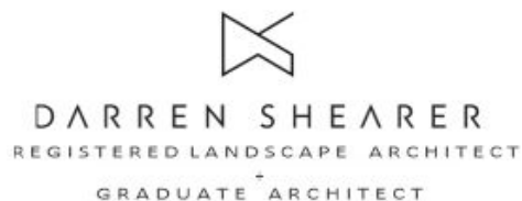
4. Darren Shearer Landscape Architect